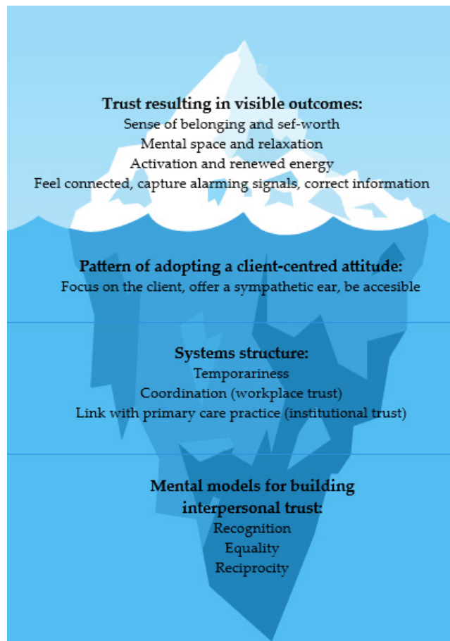
Figure 3. Program theory presented in the iceberg model.

and by their professional caregivers. More specifically, the link with primary care practice is an important facilitator for a trustful relationship to evolve between CHWs and clients. As well as for CHWs as for clients, this link appears to build trust that the right people for the right reasons are referred to the CHWs.